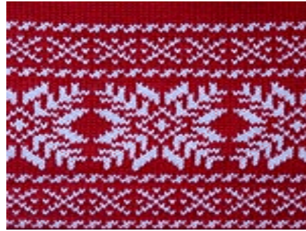
Fair Isle pattern